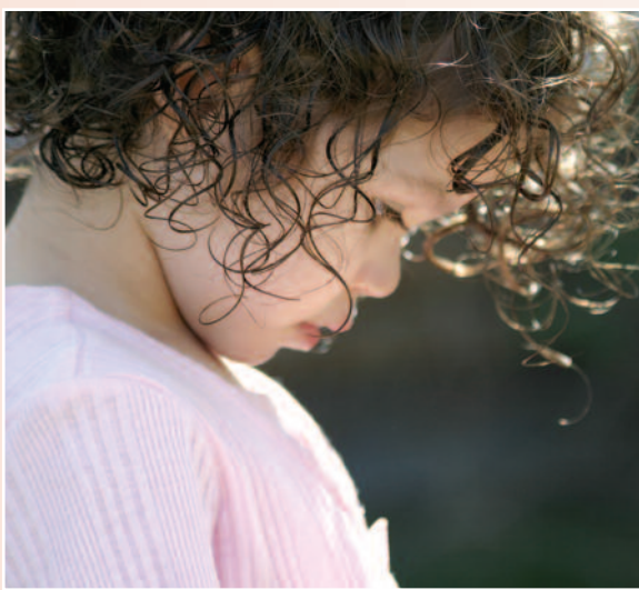
For a child to lose a parent or a sibling can radically affect their life. When death is traumatic the child may develop particular stress reactions.

The child may ask further questions. If they don't it is good to ask if they need to know anything else right then.